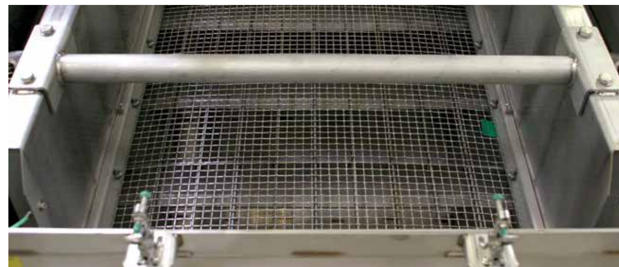
Multiple mesh sizes available