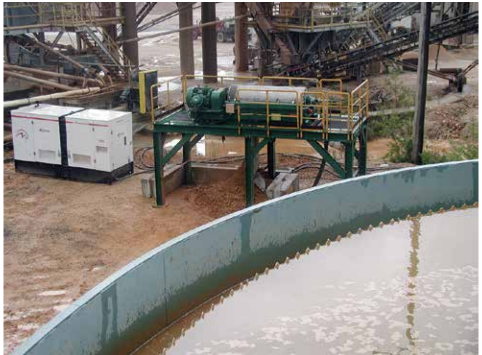
DE-7200 centrifuge dewateres super fines into stackable/conveyable form at 72% solids by weight

High solids recovery units—the Derrick HI-G® Dewatering Machine unit (combination of Derrick hydrocyclones and Derrick high G dewatering screens)—were installed at each Valley facility.